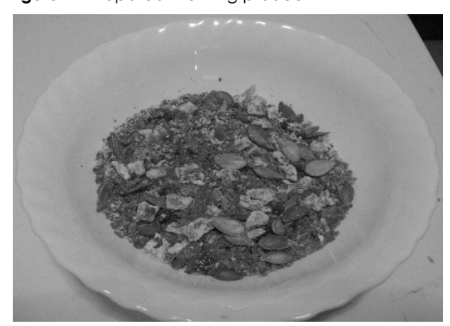
Figure 2 - Prepared morning product

It was observed that the food waste is available for a desired amount at the same temperature, requiring different times, as observed in Table 1.