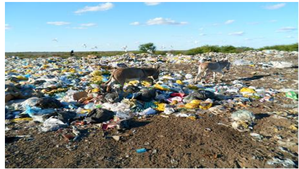
Figure 3 – Animals that feed on garbage

The collected solid waste in the municipality are destined for a dump in violation of the Federal Law No. 12,305/10 (BRASIL, 2010), which are deposited not only of home origin, but the arising of health services, the slaughterhouse and public butcher shop, trade, including a shoe factory and leather accessories. Including animals that were found dump, despite being surrounded site (Figure 3).