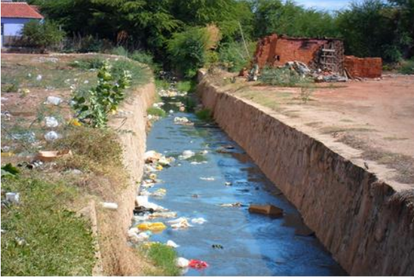
Figure 4 – Continuation of the Sewage Canal