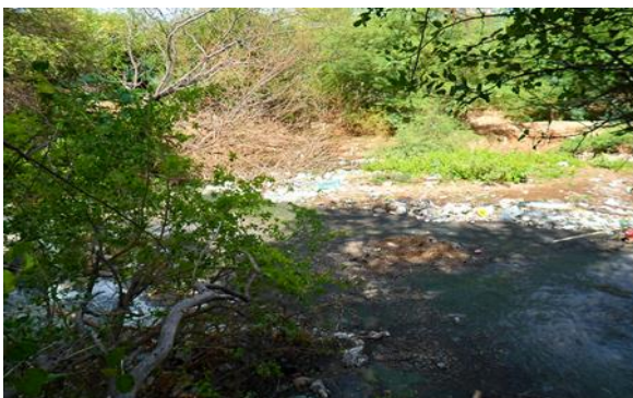
Figure 5 – River pollution Pajeú

Liquid and solid waste that channel are dumped into the river Pajeú, whose stretch observed during this research within the urban perimeter of the municipality is silted, dirty, smelly, and full of waste (tires, diapers, plastic packaging, among others) (Figure 5).