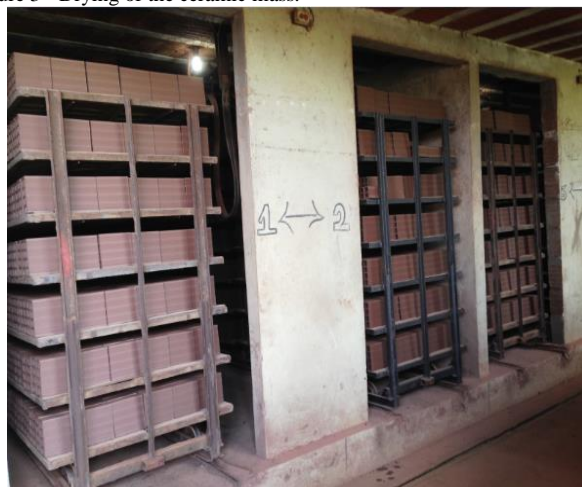
Figure 3 - Drying of the ceramic mass.

In an interview, the managers of Industry X reported not knowing about the subject of Cleaner Production. Industry X does not have a team responsible for environmental issues, a fact that would pose difficulties for the application of the CP tool.