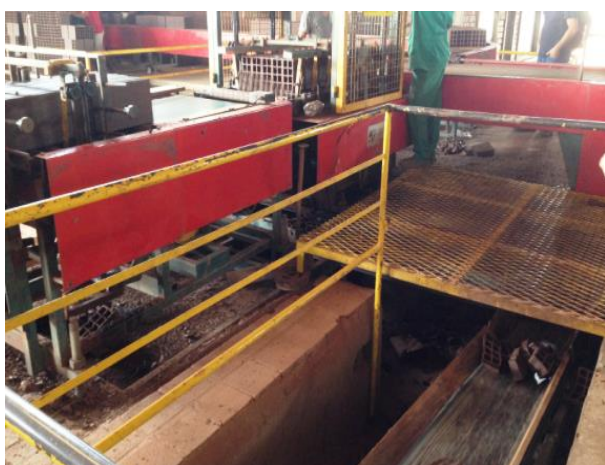
Figure 2 - Cutting area of red ceramics

In the cut-off stage, the generated residues are reincorporated into the process (Figure 2), thus meeting the SENAI-RS (2003) level 1 requirement, because the residue generated in this step falls directly on the mat to return to the modeling. Such equipment used was already a technology change implemented by the company.