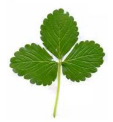
Figure 5 – Leaf of cultivar Tudla-Milsey.

Camino Real is a very cultivate for consumption "in natura". short- day plants, originating from the University of California, USA . It has high production capacity. The plants are smaller, more compact and erect and less vigorous than the cultivar Camarosa. The fruits are large, firm, with