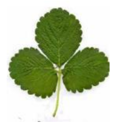
Figure 3 - Leaf cultivar Camarosa.

Sweet Charlie was obtained at the University of Florida in 1992. Plants are compact, with medium sized leaves and a lot of hairiness. Production is late, and very productive. The fruits are medium sized, firm, red - light internal color, characteristic sweet flavor, low acidity and high content of vitamin C, suitable for fresh consumption . The cultivar is tolerant to anthracnose stem and fruit, and susceptible to micosferela spot and gray mold ( SANTOS, 2003; SHASTA NURSERY ., 2004; Oliveira et al , 2005b) (Figure 4)