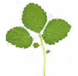
Figure 1 - Leaf cultivar Dover.

Oso Grande is a cultivar of short days and great adaptability; vigorous plant with large leaves and dark green ; median cycle and high production capacity. large fruits, firm texture of pulp at the beginning of production and average at the end of the harvest in a clear and aromatic red coloring; light red skin ; subácido flavor , fit for consumption "in natura". Tolerant gray mold (Botrytis cinerea) and susceptible to stain micosfarela (Mycosphaerella (Colletotrichum fragariae) and anthracnose fragariae and Colletotrichum acutatum) (ANTUNES, 2016) (Figure 2).