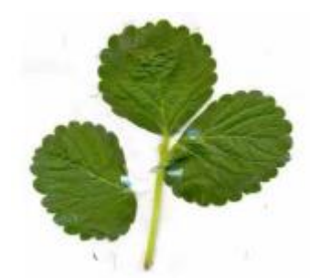
Figure 9 – Leaf of cultivar Diamante.

Campinas is a cultivar of short, rough days; great fruit and good taste; tolerance to angular leaf spot ( Xanthomonas fragariae); susceptible to Rhizoctonia sheath blight (Rhizoctonia) , anthracnose (Colletotrichum sp) and wilting Verticilium (Verticillium albo-atrum) (SANTOS, 2005) (Figure 10).