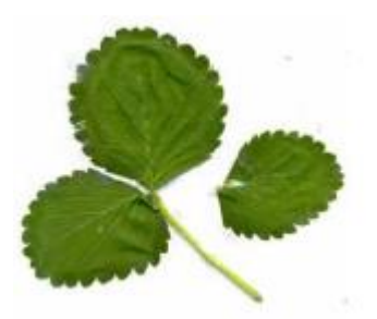
Figure 4 – Leaf of cultivar Sweet Charlie.

Tudla - Milsey is a cultivar originated from Spain. Plants are compact, medium vigor, with large sheets of dark green and root system well developed. The production cycle is slow, and very productive, maintaining the size and firmness of the fruit by the end of the harvest. The fruits have cone-shaped or elongated wedge, large size, firm flesh of red - bright color, red skin, sub- acid flavor and very aromatic and is recommended for fresh consumption and industrialization. The cultivar is tolerant to gray mold, and susceptible to micosferela spot and anthracnose stem and fruit (SANTOS . 2003; OLIVEIRA et al, 2005b) (Figure 5)