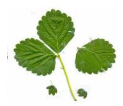
Figure 6 – Leaf of cultivar Camino Real.

Ventana is a very cultivate for consumption "in natura". Cultivating short day, originating from the University of California. It has a high yield per plant . The plants are large, strong, but not as straight. The fruits are large , moderately firm, with internal color and bright red skin, good looks and good taste , is recommended for market fresh and industrialization (ANTUNES, 2016) (Figure 7) . Figure 7 – Leaf of cultivar Ventana.