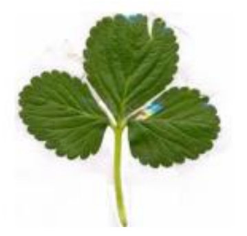
Figure 8 – Leaf of cultivar Aromas.

Diamante was obtained at the University of California in 1997. The plants are upright and compact , conducive to dense crops. It is very productive , producing large fruit , firm and of excellent quality and is recommended for fresh consumption . The coloring of the fruit inside is light red , so it is not suitable for industrialization , farming neutral days (ANTUNES, 2016) (Figure 9).