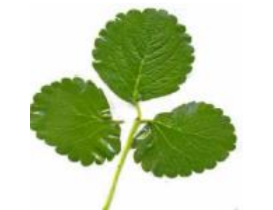
Figure 2 - Leaf cultivar Oso Grande.

Oso Grande is a cultivar of short days and great adaptability; vigorous plant with large leaves and dark green ; median cycle and high production capacity. large fruits, firm texture of pulp at the beginning of production and average at the end of the harvest in a clear and aromatic red coloring; light red skin ; subácido flavor , fit for consumption "in natura". Tolerant gray mold (Botrytis cinerea) and susceptible to stain micosfarela (Mycosphaerella (Colletotrichum fragariae) and anthracnose fragariae and Colletotrichum acutatum) (ANTUNES, 2016) (Figure 2).