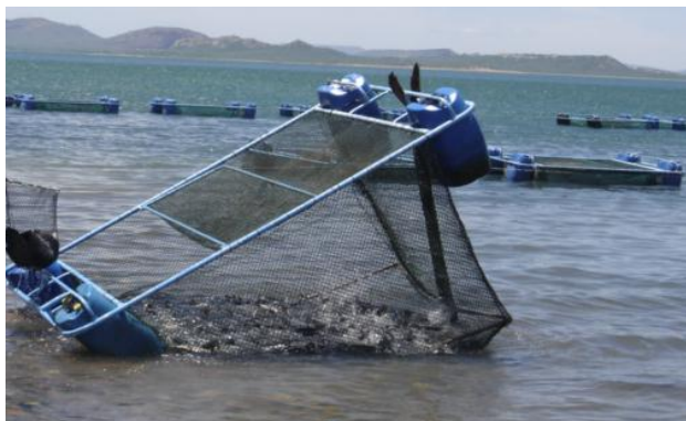
Figure 3 – Fish farming in Lake Sobradinho.