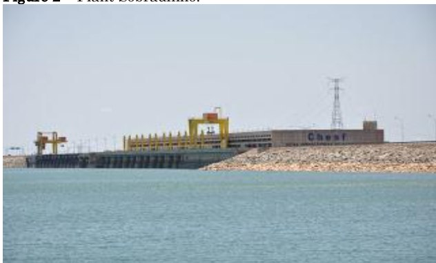
Figure 2 – Plant Sobradinho.

A documentary research involves research in internal documents (or external) regarding the organization studied. The advantage of using internal documents, such statute, regulation, reports and manuals is the availability and low cost (ZANELLA, 2009).