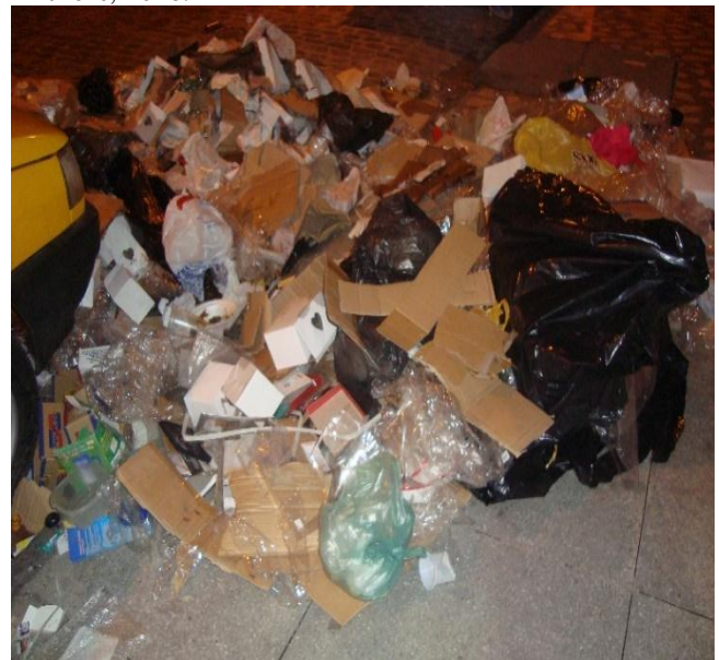
Figure 2 - Photo of waste disposal in the street.

Before the waste disposed to the collection comes to the figure of scavengers present are not properly prepared for the collection of waste and their carts human-powered gathering with great turmoil the most valuable waste and greater volume, cardboards, there is a method , a care the issue is just getting enough to survive another day. After the first wave reaches a slower second in order to pick up what was left behind and that were deposited after the passage, those vying for space with the official sweeping team starts its service agglomerating waste in places where already there are disposed a greater amount, as shown in figure 2 and figure 3.