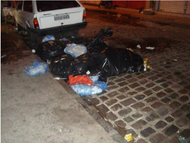
Figure 1 - Waste deposited for collection.

It can be seen in Figure 1 about 20 bags with an estimated volume of about 50 liters each corresponding to 1,000 liters in front of this property.