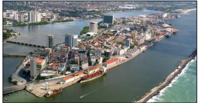
Figure 3 - Panoramic view of Port of Recife.