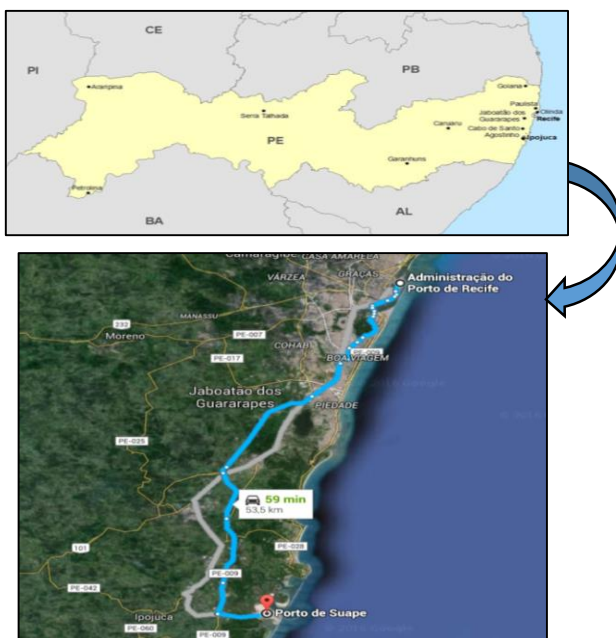
Figure 1 – Location of the ports of Recife and Suape.

The Port of Recife is located in the capital of Pernambuco, in Recife, where it functions providing services, taking long-haul and cabotage vessels (Cabotage is the navigation between the same country ports using sea routes or routes inland) for the import and export of domestic cargo, in addition to receiving cruise ships and having a Terminal Passenger Ferry. Its activities are: providing calm waters for berthing, the availability of cots and places for storage (warehouses and courtyards), and the security required to carry out the port operations (Port of Recife, 2016).