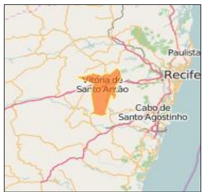
Figure 1 – Vitoria de Santo Antao City, Pernambuco.

Natuba (Figure 2) is concentrated in small north areas in Vitoria de Santo Antao, occupying about 2.8% of the basin Tapacura and its population is estimated at 994 inhabitants, representing approximately 7% of the rural population of the municipality.